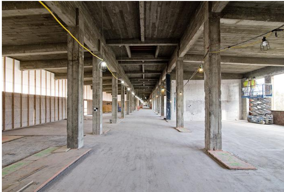
The building has been stripped down to its structural elements; selective demolition and abatement is approximately 80 percent complete.