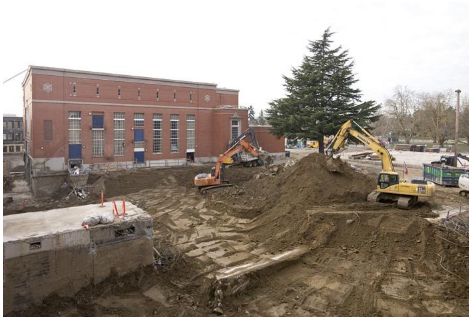
Excavation is ongoing for an expansion and courtyards on the west side of the main building.