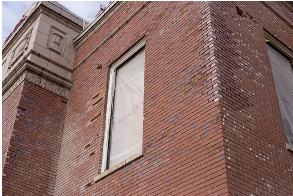
Bricks on the 1923-era gymnasium building that are in need of replacement have been marked with colored tape.