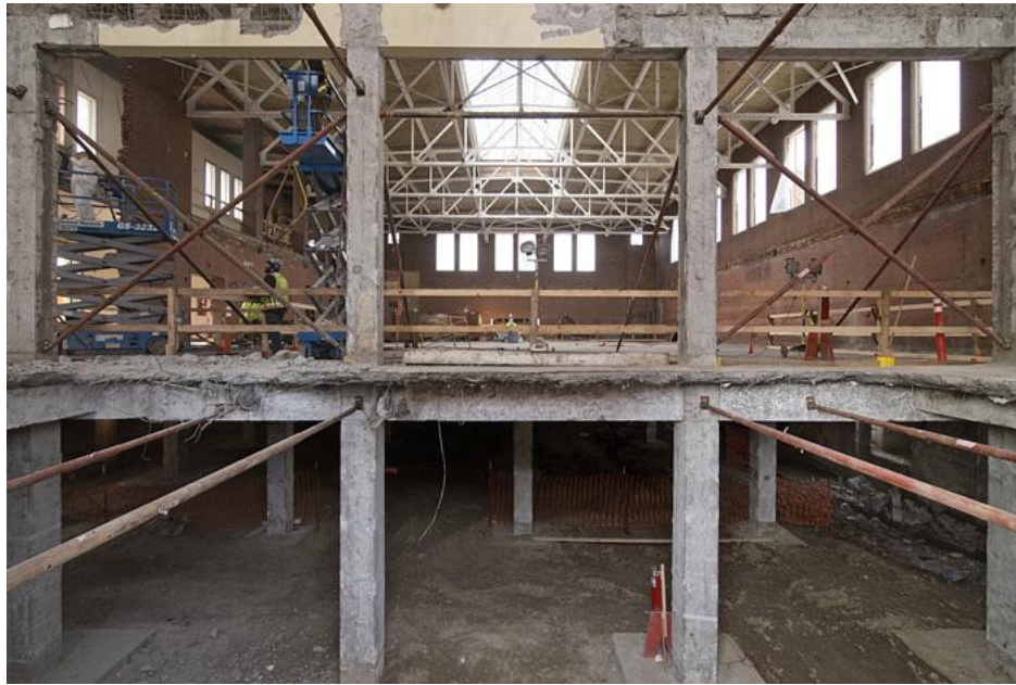
The school's original gymnasium, which was replaced with a "new gym" built in 1956, is being converted to a two-story visual arts complex.