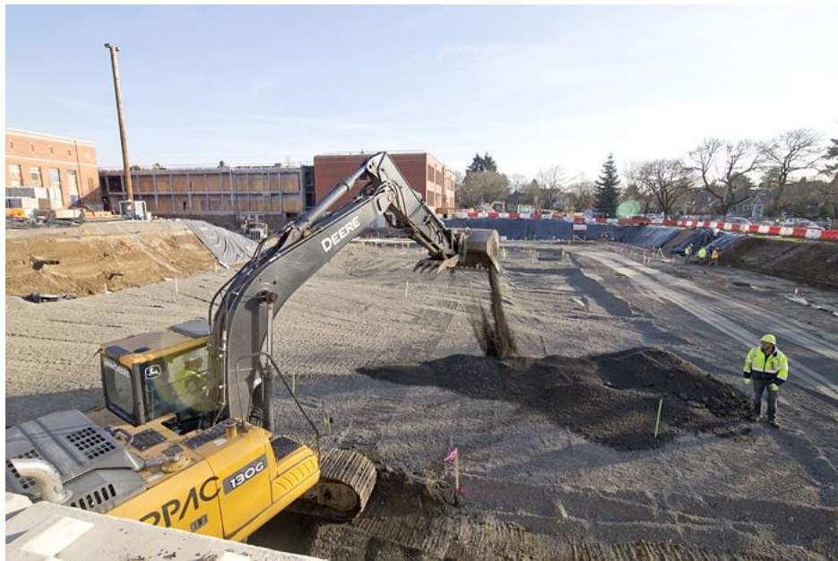
Crews are pouring the rock pad for the foundation of a new two-story gymnasium.