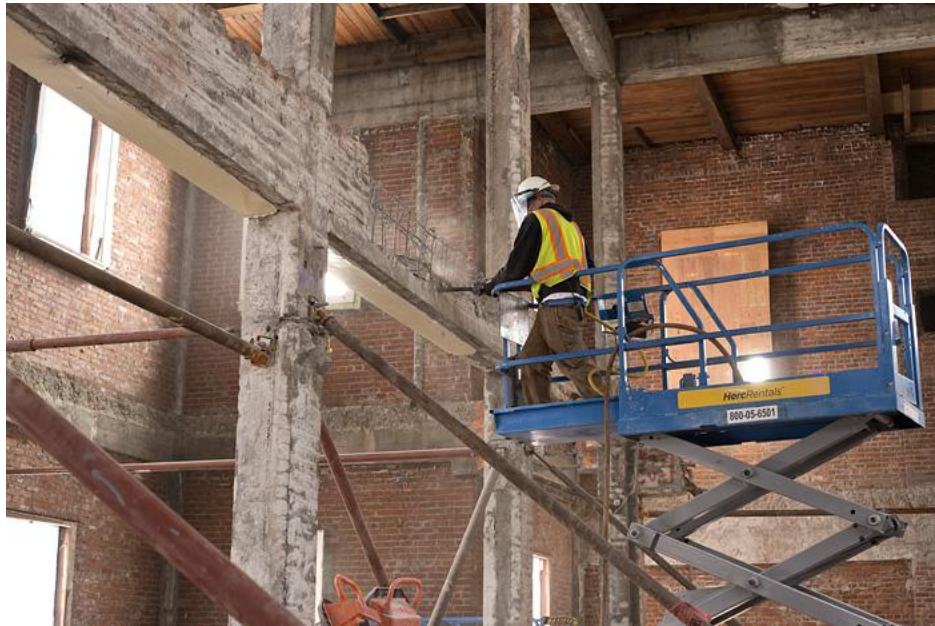
An employee of NorthStar demolishes concrete in the original gymnasium building.